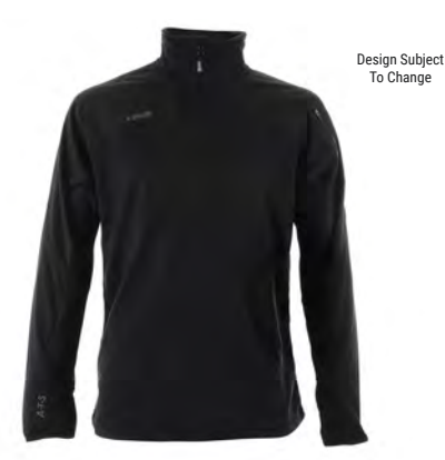
ATS TECH FLEECE Black